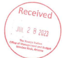
Dr. Buu Nygren, President THE NAVAJO NATION