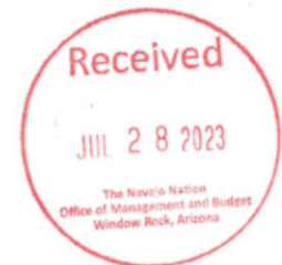
Dr. Buu Nygren, President THE NAVAJO NATION